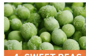
4. SWEET PEAS FROZEN