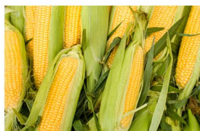
2. SWEET CORN*